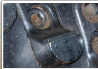
Unique Cutting Action

Individually positioned cutting teeth are replaceable at a low cost and in minutes.