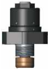
Torque Limiter Module Fig 1