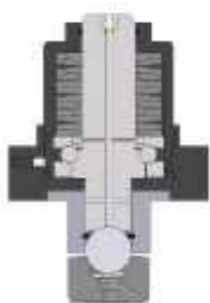
Engaged Fig 2