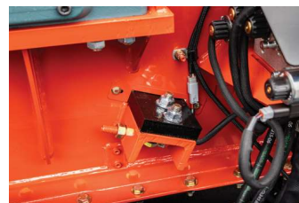
Side Load Anvil