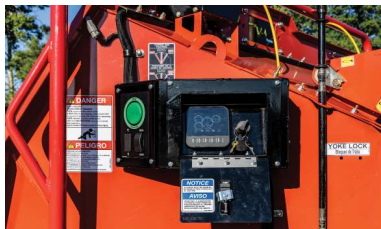
Infeed-Mounted Control Panel