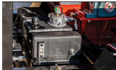
Composite Fuel and Hydraulic Tanks