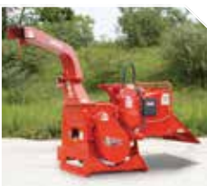
PTO: M8D, M12R, M15R