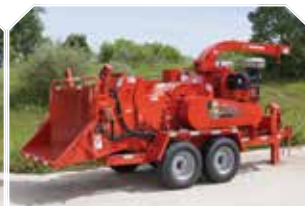
M18R, tandem axle