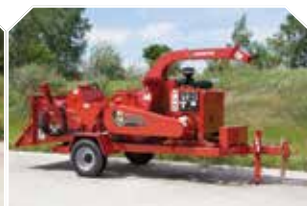
M18R, single axle