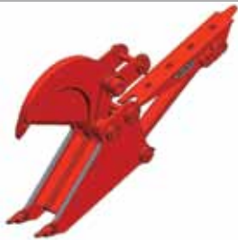
Model 40 Debris Shear

Carrier weight classification . . .30,000 – 50,000 lbs. Rec. operating pressure for shear . . . carrier-specific Rec. hydraulic flow . . . . . carrier-specific Main pivot pin . . . . . 4" diameter Capacity . . . . . 40"