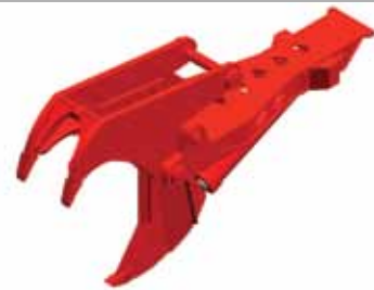
Model 60 Talon Debris Shear

Carrier weight classification . . .30,000 – 50,000 lbs. Rec. operating pressure for shear . . . carrier-specific Rec. hydraulic flow . . . . . carrier-specific Main pivot pin . . . . . 4" diameter Capacity . . . . . 40"