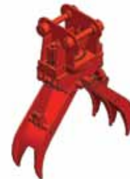
Model 60 Mor-bite™ Grapple

Base length. . . . . 5'11.625" Base width (11 tine) . . . . . 82" Base width (13 tine) . . . . . 102" Weight (11 tine) . . . . . 3,500 lbs. (less mounts) Weight (13 tine) . . . . . 4,000 lbs. (less mounts) Hinge pins . . . . . 2" diameter chrome Maximum clamp opening . . . . . 6'5.25"