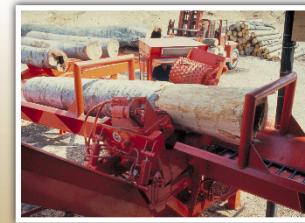
The all steel infeed conveyor is fabricated from 5/8" formed plate steel with 3/8" gussets is equipped with Morbark's exclusive all-steel welded track type chain